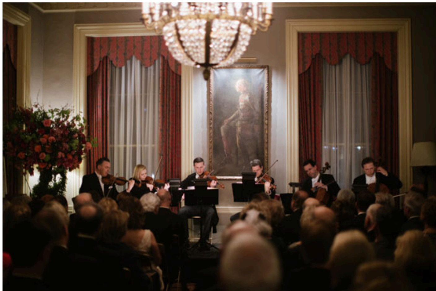
Vienna Philharmonic Orchestra Ensemble playing Brahms' String Sextet in G Major, Op. 36